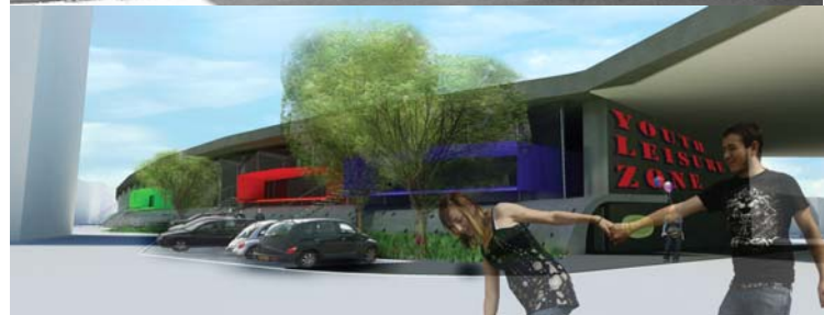
The Southern Arches today (top right) and an artist's impression of the Youth Leisure Zone (bottom right)