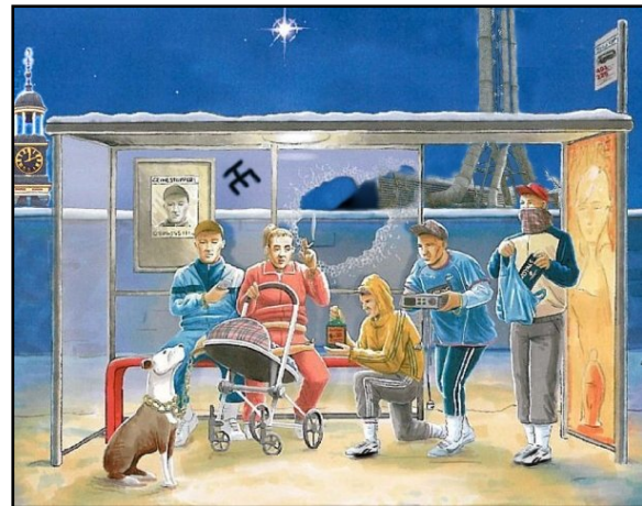
'A wintry night in Thamesmead'

We recently came across this piece of artwork from one of our 'friends' which although not particularly positive certainly demonstrates artistic talent. You should be able to make out the clock tower and old boiler house.